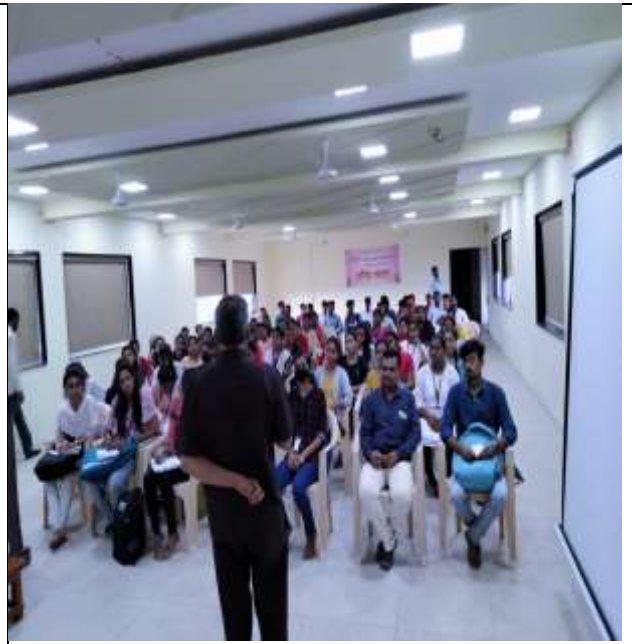
Students attending the programme