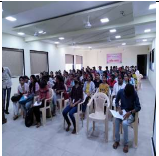
Students attending the programme