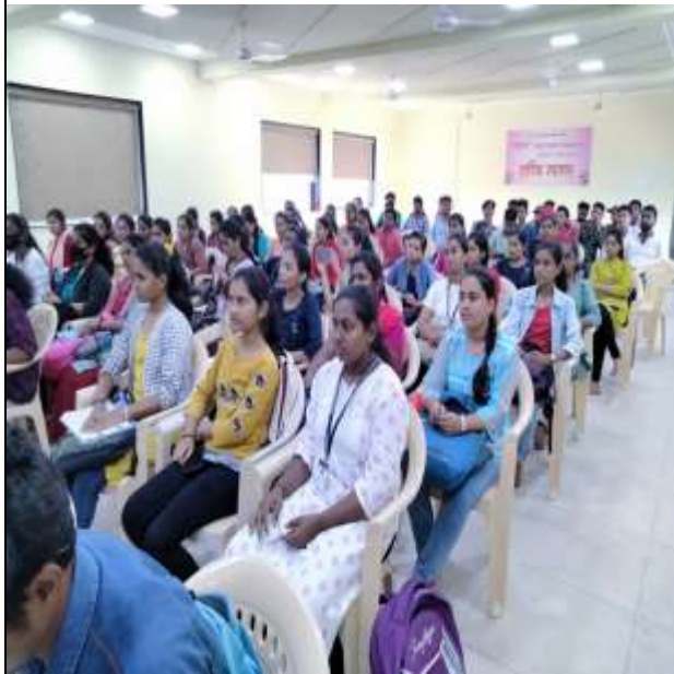
Students attending the programme